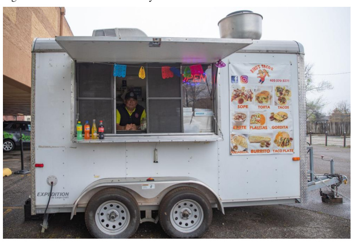
Rikos's Tacos on March 24.